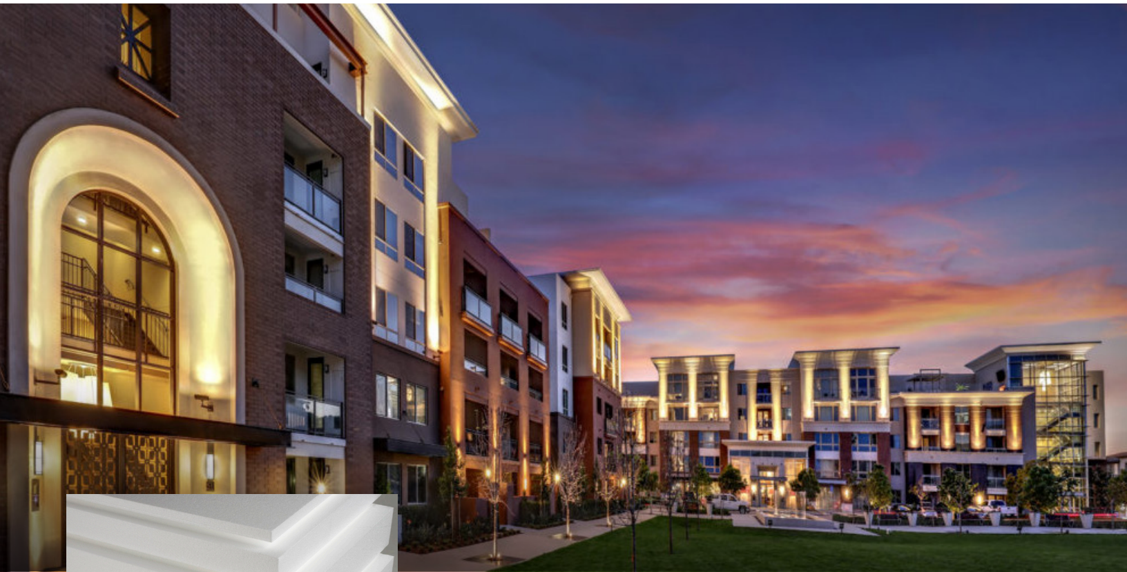
ThermalStar Below Grade Insulation Board

FOUNDATION WALL | UNDERSLAB | COLD STORAGE